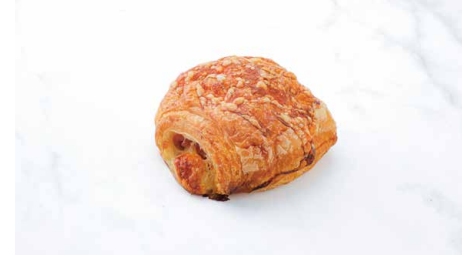
Ham & Cheese Croissant 火腿芝士牛角包