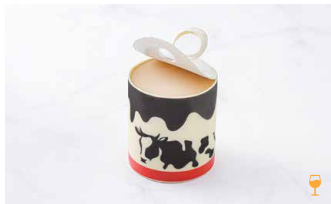
Milk Tin Panna Cotta 黑白奶罐 65 A white-chocolate "tin" with salted caramel panna cotta and a rum-soaked brioche center 白朱古力「鐵罐」、海鹽焦糖奶凍、麻酒牛油蛋糕