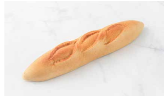
Baguette Pound Cake 長棍麵包 168 Lemon Pound Cake 檸檬牛油蛋糕