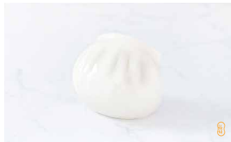
Har Gow 蝦餃 69 Rose & strawberry jam, peach mousse, almond biscuit, white chocolate spray 玫瑰士多啤梨果醬、蜜桃慕絲、杏仁餅、白朱古力