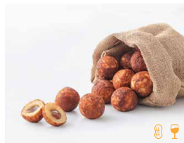
Chestnut Madeleines 炒栗子 (8 PCS 粒) 68 Fluffy madeleines filled with gooey molten whiskey chestnut cream, served warm 即點即製瑪德蓮蛋糕，內裏包裹濃稠的威士忌栗子忌廉餡，熱辣辣送上

Also available with fresh milk upon request 另可選鮮奶