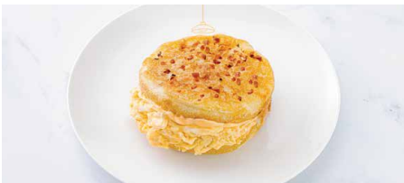
Turnip Cake English Muffin with Soft Scrambled Eggs 蘿蔔糕英式鬆餅配炒滑蛋 78 Soft scrambled eggs in a homemade turnip cake English muffin with sliced turnip, spiced pork, shiitake, and dried shrimp, and Yu Kwen Yick chili mayonnaise 嫩滑炒蛋夾在在自家製的英式鬆餅，鬆餅加入蘿蔔絲、蝦米、冬菇及臘肉，配上余均益辣椒蛋黃醬