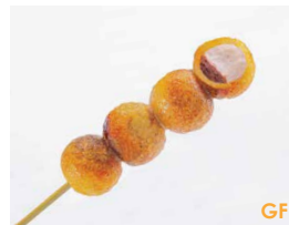
Fish Balls 魚蛋 68 Chewy mochi "fish balls" filled with homemade red bean ice cream, torched to order until caramelized 煙韌糯米糍「魚蛋」內裏是自家製紅豆雪糕，以火槍燒至焦脆