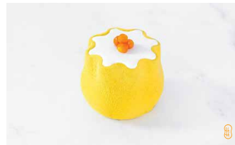
Siu Mai 燒賣 69 Pear jelly, flourless chocolate biscuit, milk chocolate mousse, chocolate feuilletine crunchies, white chocolate glaze & spray 啤梨啫喱、朱古力餅(無麵粉)、牛奶朱古力慕絲、朱古力脆餅、白朱古力