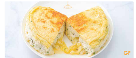
Omelette Soufflé 法式芝士梳乎厘奄列 88 A classic French omelette soufflé with fresh herbs, Fontina and Gruyère cheese 傳統的法式梳乎厘奄列，加入軟糯的 Fontina 及 Gruyère 芝士，以及新鮮香草 Dine-in Only 只供堂食