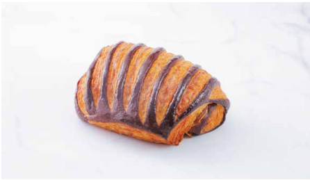
Pain au Chocolat 朱古力牛角包

With three batons of chocolate 朱古力分量是一般朱古力牛角酥的三倍