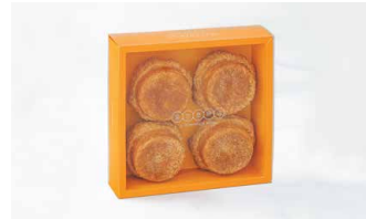
DKA (Dominique's Kouign Amann) 168 4PC Gift Box 四件裝禮盒