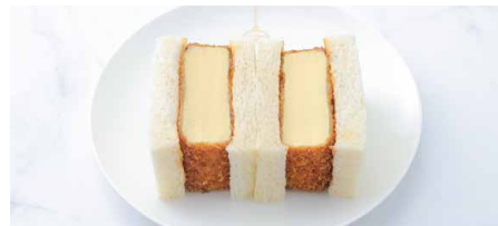
Silk Egg Katsu Sando 吉列滑蛋三文治 88 Crispy panko-crusted fluffy steamed eggs and XO mayonnaise on homemade Japanese milk bread 以日式麵包糠包着軟滑的蒸蛋炸至脆身，自家製的日式牛油麵包上塗上 XO 蛋黃醬