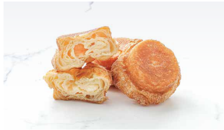
DKA (Dominique's Kouign Amann) (1 PC 個)

A flaky, caramelized croissant with tender layers inside and a caramelized crunchy crust. Our best-seller worldwide! 全球各店最熱賣的產品！內層香軟酥化，外層則是脆身的焦糖化皮層，似是酥化、焦糖化的牛角包