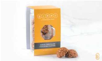
Azelia Chocolate Feuilletine Clusters 148 焦糖朱古力脆片球