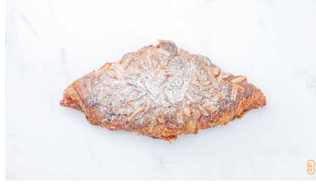
Almond Croissant 杏仁牛角包