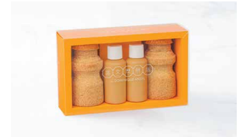
Hong Kong Milk Tea Cookie Shot 108 港式奶茶曲奇杯 2PC Gift Box 兩件裝禮盒