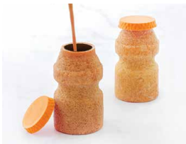
HK Milk Tea Cookie Shot 港式奶茶曲奇杯 (1 PC 個) 48 A snickerdoodle sugar cookie "cup" filled to order with cold-brewed milk tea - sip the milk tea, then enjoy the cookie! 肉桂曲奇「杯」，另附上冷萃奶茶「即沖即食」

Also available with fresh milk upon request 另可選鮮奶