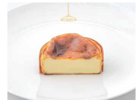
Egg Roll Egg Tart 蛋卷蛋撻 38 Hand-rolled egg roll tuile crust with a silky custard center, served warm 手工蛋卷薄片捲成蛋撻殼，注入幼滑蛋漿，新鮮出爐熱辣送上 Available starting 12nn 中午12時起供應