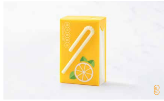
Lemon Juice Box 紙包檸檬茶 62 Earl grey mascarpone mousse, bergamot curd, almond biscuit, crispy feuilletine, white chocolate 伯爵茶馬斯卡彭慕絲、佛手柑奶酪、杏仁餅、脆片餅乾、白朱古力