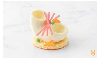
Macaroni 火腿通 58 Silky cheesecake with a hint of lemon, soft almond biscuit, hand-cut white chocolate "ham" and crispy "peas", marshmallow "carrot" 帶檸檬香氣的絲滑芝士蛋糕、杏仁軟餅、手工白朱古力「火腿」及脆「青豆」、棉花糖「紅蘿蔔」