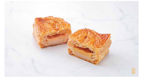
Mochi Peanut Chausson 麻糬花生甜酥