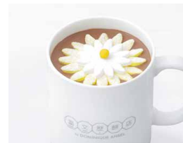
Blossoming Hot Chocolate 棉花糖熱朱古力 68 Watch the marshmallow chrysanthemum bloom! 看着棉花糖花兒盛開！