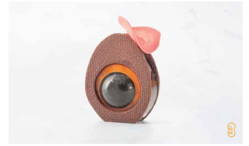
Thousand Year Egg 皮蛋 58 Chocolate mousse, caramelized hazelnut cremeux, chocolate sablé cookies, coffee black sesame gelée "yolk", white chocolate "ginger" 朱古力慕絲、焦糖化榛子奶油、朱古力奶油曲奇、咖啡黑芝麻果凍「蛋黃」、白朱古力「子薑」